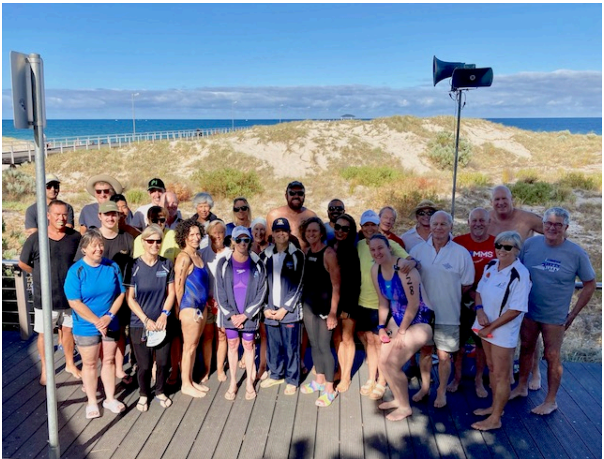
Adelaide's 2023 Jetty to Jetty swimmers